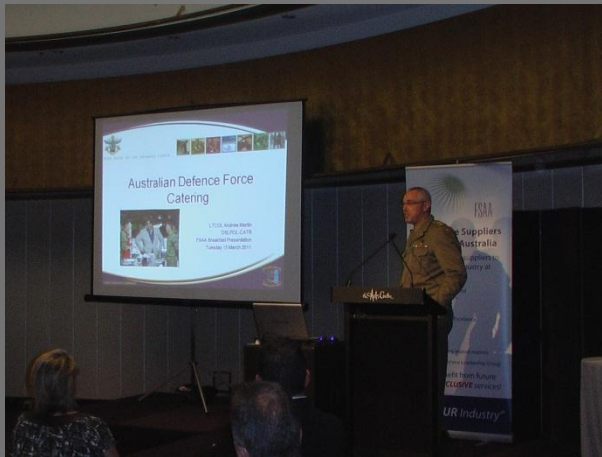
A few photos from our recent activities in Sydney and Melbourne.